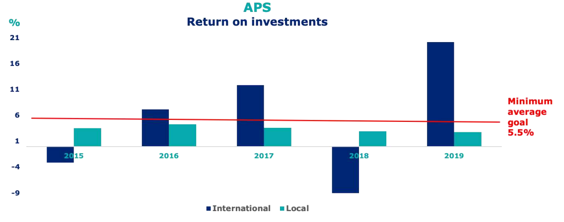
Figure 3: Return on investment on local and international investments

Reallocations within the international portfolio contributed to the positive result.<sup>12</sup> There was no investment plan established for the year 2019. APS reports that it acted in accordance with the 2018 investment plan, taking into account adjustments to the MIPS. Figure 3 shows the return on investments from 2015.