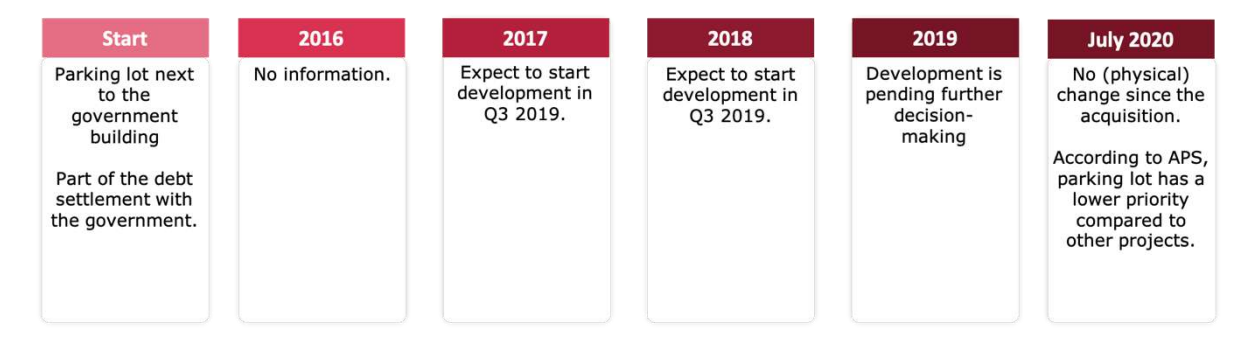
Figure 5: Parking lot project based on APS' financial statements and the current status

development of the parking lot according to information derived from APS' financial statements along with the current state of affairs.