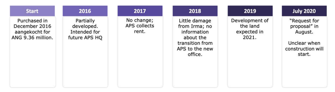
Figure 6: the office park based on APS' financial statements and including the current status