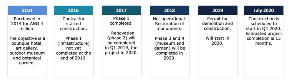
Figure 4: development of Mary's Fancy based on APS' financial statements and current status

In their response, APS indicates that external factors are often the cause of scheduling changes. In the case of Mary's Fancy, these include lengthy permit application processes and a delay in the selection process for an architect caused by the 2017 hurricanes. 15 However, this "new" information is not provided in the financial statements. Figure 4 shows the information derived from the respective financial statements over the period 2016 to 2019. With incomplete information in the financial statements, broad insight into investments is also absent. We advise APS to, in future, provide a more comprehensive and complete presentation of the status of the project. Realistic planning, taking into account possible setbacks, should be available.